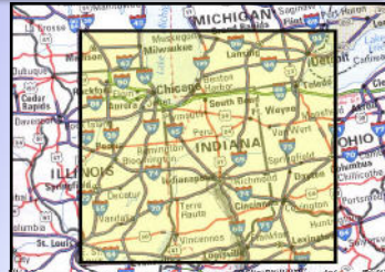
The New Jerusalem is a perfect square and is the size of several states, approximately 375 miles on each side.

6) What will be in the midst of the Holy City? -Revelation 22:2.